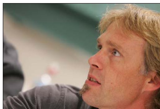
OIT: Klamath Falls